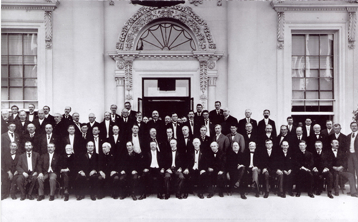
Conference of Governors at the White House, 1908